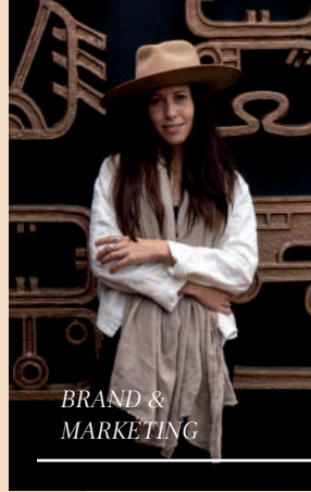
BRAND & MARKETING