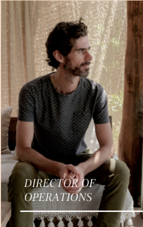
DIRECTOR OF OPERATIONS