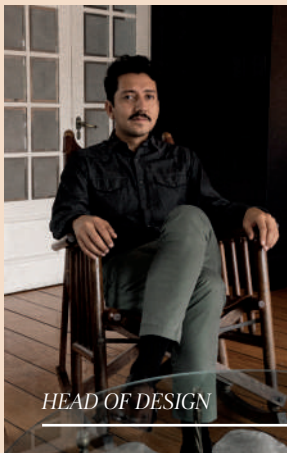
HEAD OF DESIGN