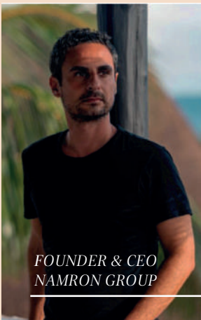
FOUNDER & CEO NAMRON GROUP

The Namron Hospitality Group's executive team collectively holds 75+ years of experience in Hospitality Service & Operations, more importantly, they're passionate about what they do.